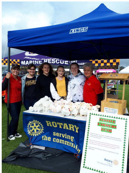
Taking the lambs to market