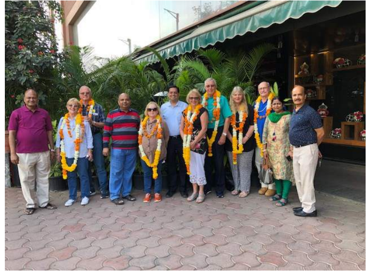
This photo shows the team and their hosts when they picked us up this morning at the Hotel Infiniti. As usual we received the typical Indian welcome with necklaces and many marigold garlands