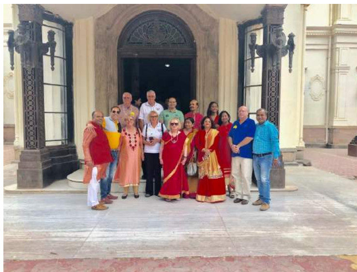
The team outside a Palace in Indore