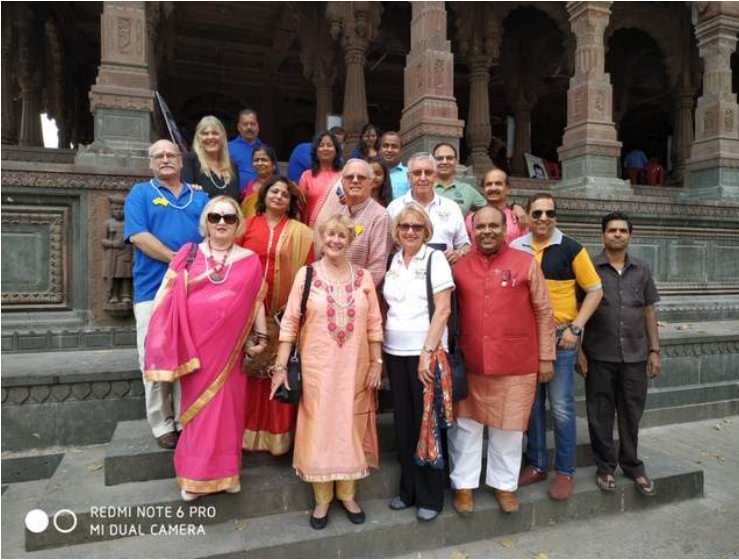
This is the team outside a temple in Indore